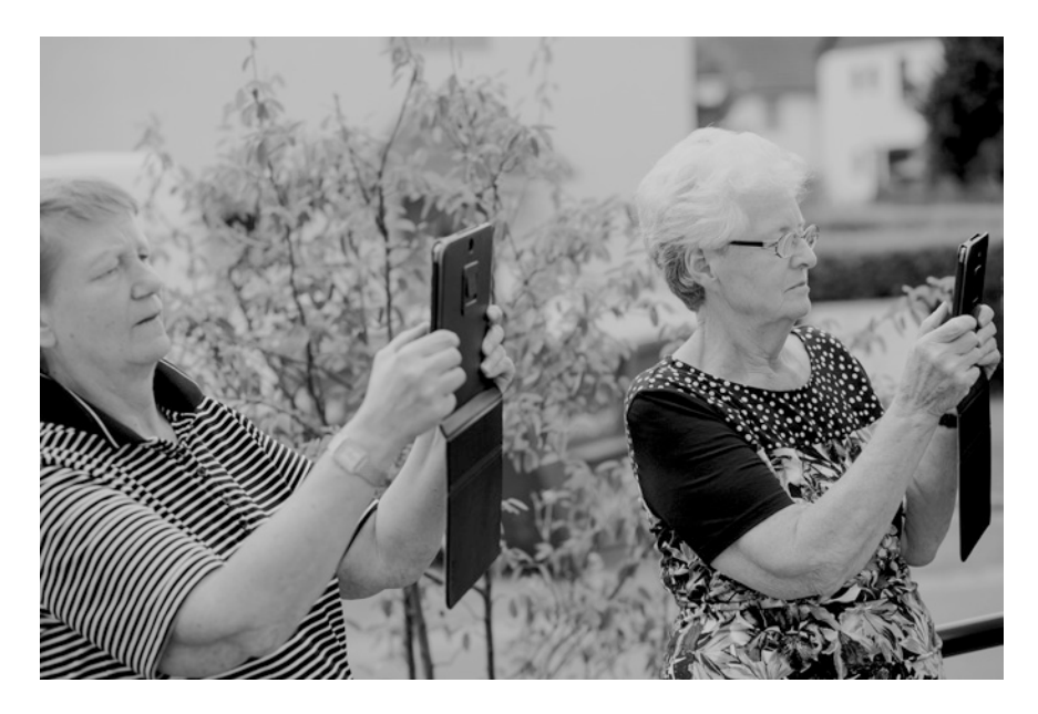
Fig. 2 Participants taking photos with their tablets

it also became evident that constant repetition and usage of the medium was necessary and a key to understanding and memorizing the functionalities. Nowadays, for most, writing and receiving emails is not a novelty anymore but has become a part of their live and a contribution to their quality of live.